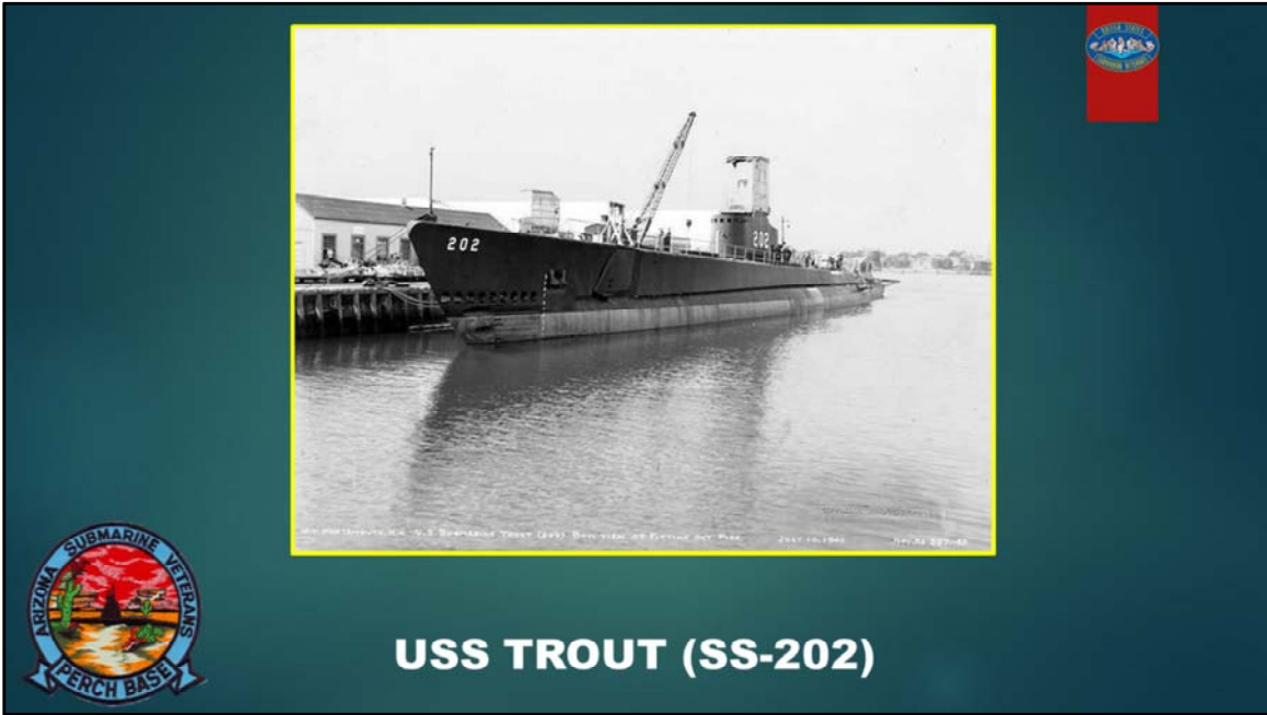
USS TROUT (SS-202)

On 29 February 1944, USS TROUT (SS-202) was sunk by enemy escorts in the middle of the Philippines Basin after sinking a passenger-cargoman and damaging another convoy.