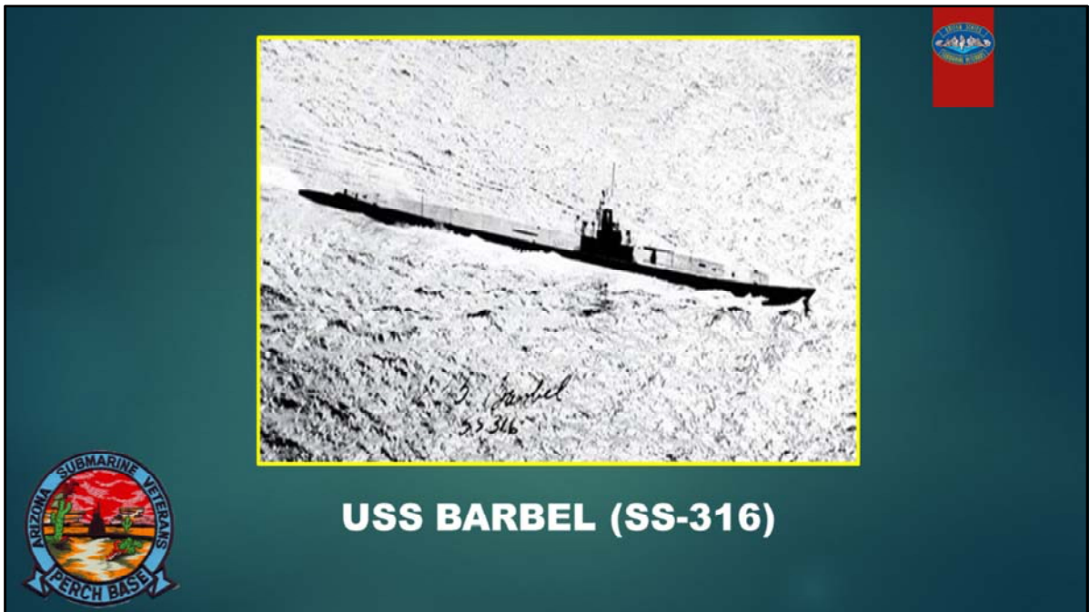
USS BARBEL (SS-316)

On February 3rd, 1945, USS BARBEL (SS-316) was attacked by aircraft three times with depth charges near the southern entrance to the Palawan Passage, and stated she would transmit a message “tomorrow night” giving information. This was the last contact with BARBEL. 81 men lost. (Bell & slide)