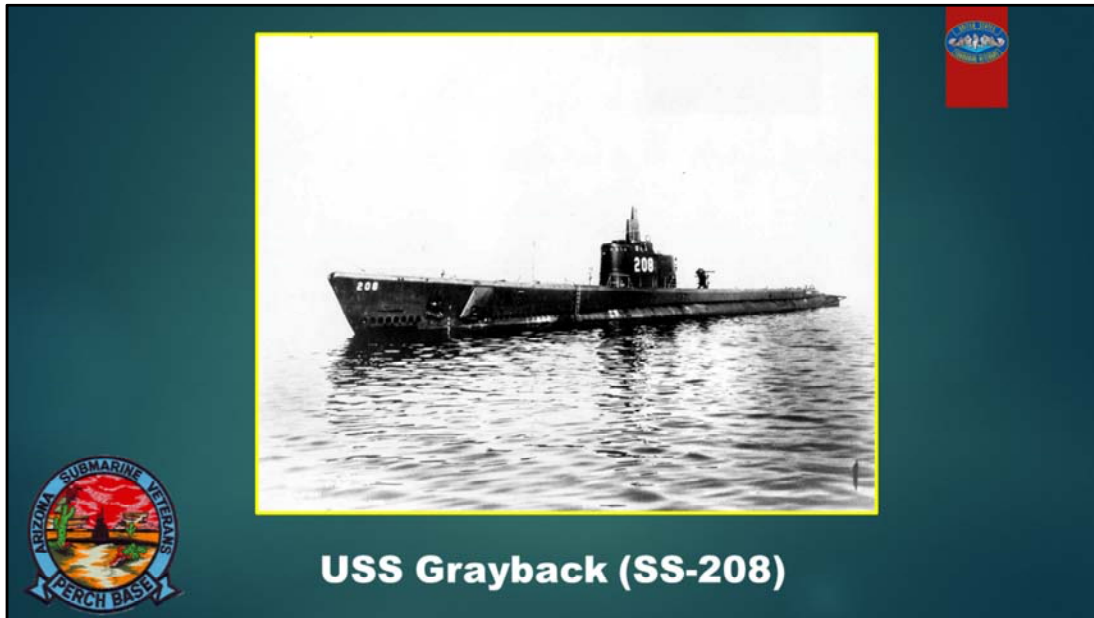
USS Grayback (SS-208)

USS Grayback's (SS-208) tenth patrol, her most successful in terms of tonnage sunk, was also to be her last. From captured Japanese records the submarine's last few days can be pieced together. Heading home through the East China Sea, on 27 February, 1944, GRAYBACK used her last two torpedoes to sink the freighter CEYLON MARU . That same day, a Japanese carrier-based plane spotted a submarine on the surface in the East China Sea and attacked. According to Japanese reports the submarine "exploded and sank immediately," but antisubmarine craft were called in to depth-charge the area, clearly marked by a trail of air bubbles, until at last a heavy oil slick swelled to the surface. GRAYBACK had ended her last patrol, one which cost the enemy some 21,594 tons of shipping. 81 men lost. (Bell & slide)